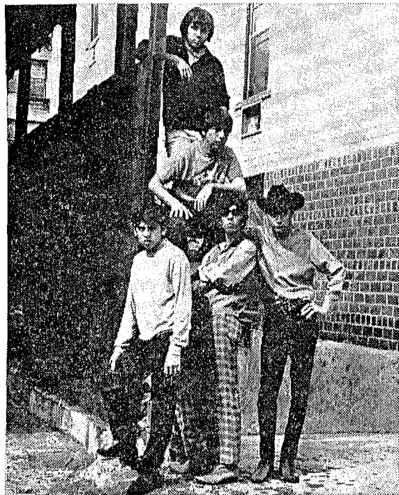
Featured at G.L.C. Weekend Saturday, February 18 Question Mark and the Mysterians