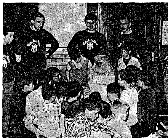
Santa Claus distributes gifts at BIB's Christmas Party.