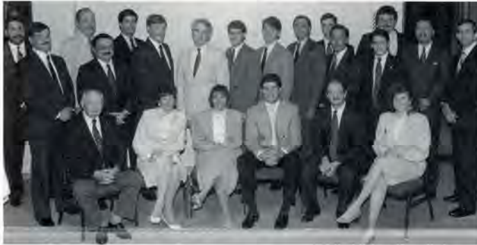
The Alumni Association Executive Board at their first meeting of the year.