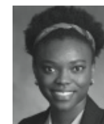
Ugonna Ihuoma Iheme