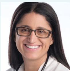
Dr. Mona Hanna-Attisha