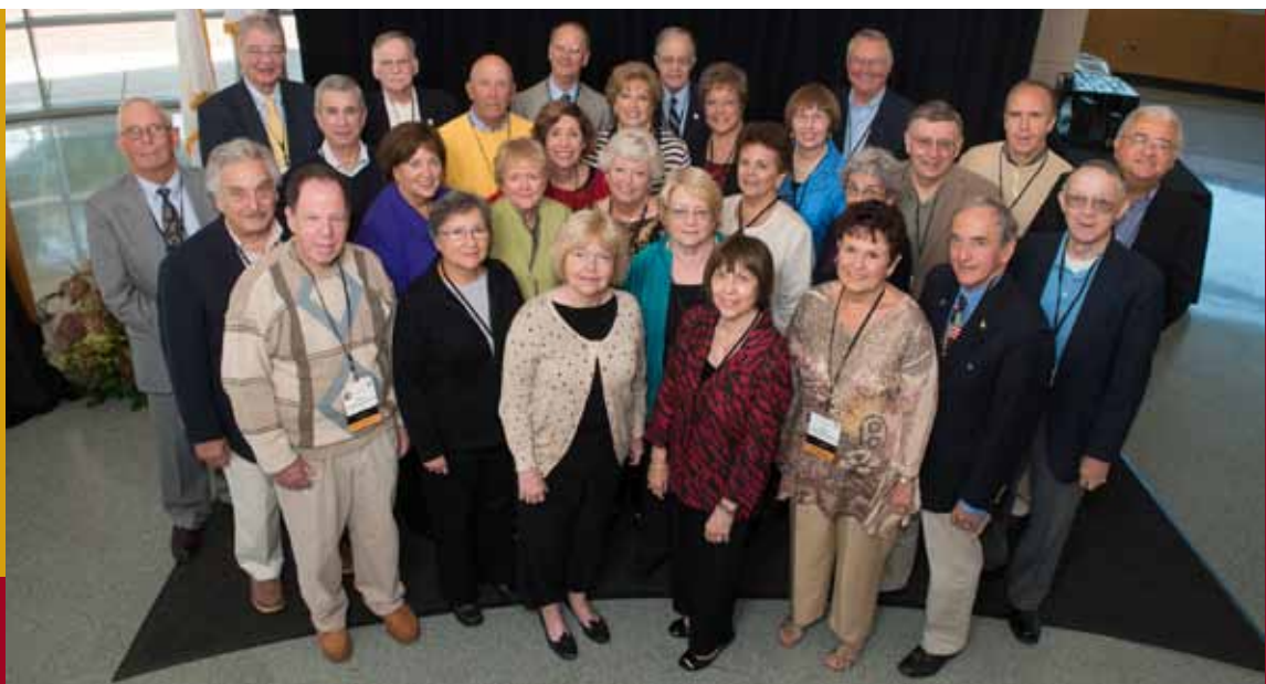
Members of the Class of 1962 inducted into the Loyal Guard

Reunion is scheduled for October 11-13, 2013 during Bryant's celebration of its 150th year as an institution!