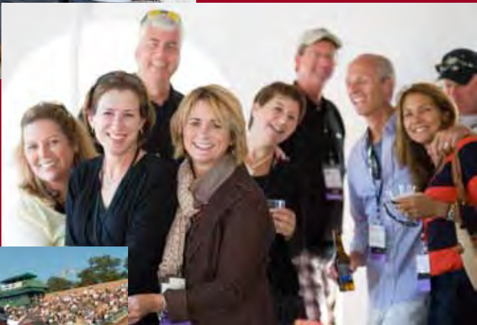
Some members of the 30th Reunion Class of 1982