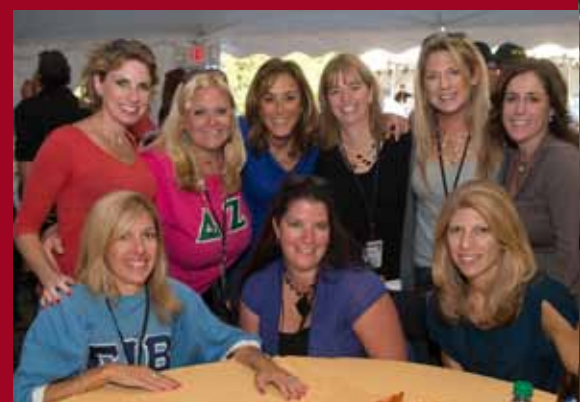
Delta Zeta alumnae