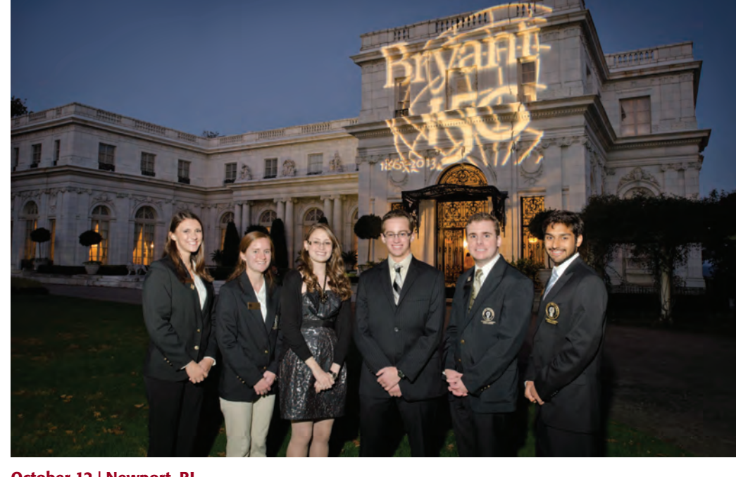
October 12 | Newport, RI Bryant Student Alumni Association student members attended the Sesquicentennial Gala at the Rosecliff mansion to greet and guide the guests and to discuss how much scholarship support has meant to them.