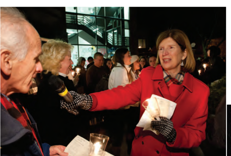
December 11 | Smithfield, RI Alumni, students, and staff joined in the 37th annual Festival of Lights that kicked off the holiday season in December. This multidenominational celebration included food, music, readings, and a candlelight ceremony that included the lighting of a campus tree and menorah. The Festival of Lights also marked the conclusion of Bryant's year-long sesquicentennial celebration.