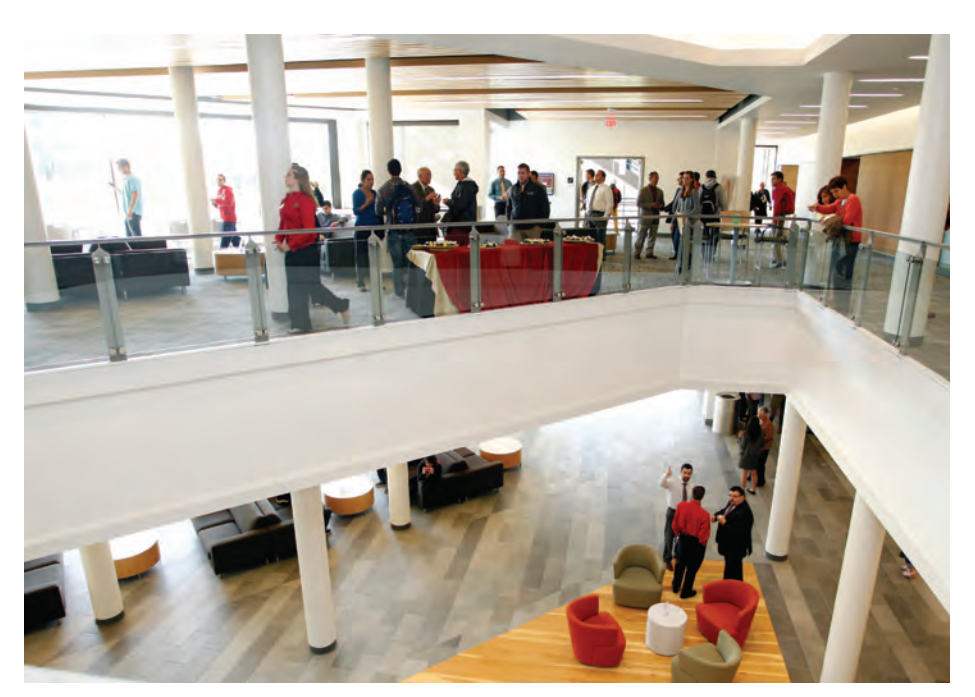
The bright and airy Fisher Student Center offers many spaces to relax, work in groups, and has offices for major student organizations and support centers.

Bryant University reopened the completely transformed student center, a $10 million endeavor that was completed over the summer, in time for alumni to tour the stunning facility during Reunion @ Homecoming, Oct. 11-12, 2013.