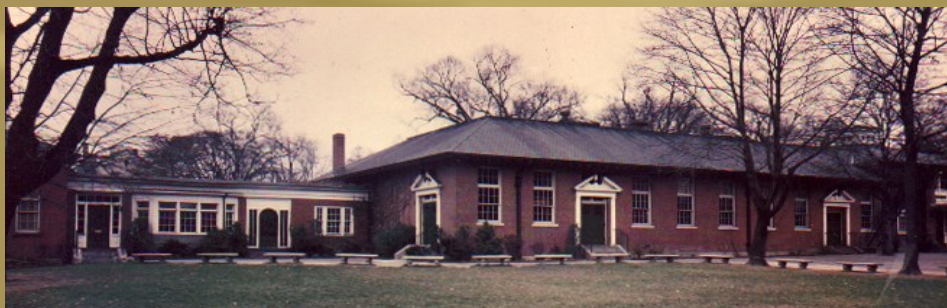
Auditorium Building 1950s & 60s

Bryant's former Student Activities Center was at the corner of Power and Hope Streets in Providence. It was formally dedicated in May of 1967