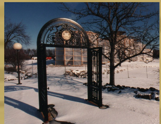
Bryant Center 1986

In the fall of 1986, the current Bryant Center (now under renovation) opened its doors. This photo was taken in the winter of 1986