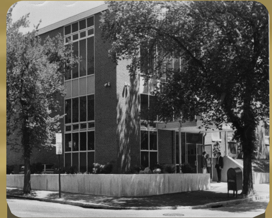
Student Activities Center 1967

Instead, Faculty House was demolished and a new Student Activities Center was constructed on this very site in 1966. Utilized by Bryant students for just 5 years, this center was sold to Brown University in 1969-1971, along with Bryant's other east side campus buildings, and is currently being used as a music practice center for Brown students.