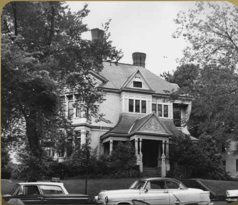
Faculty House 1950s

Faculty House , once located on Providence's East Side at the corner of Hope and Power Streets was purchased in the 1950s by Bryant for $35,000 to house offices for male faculty.