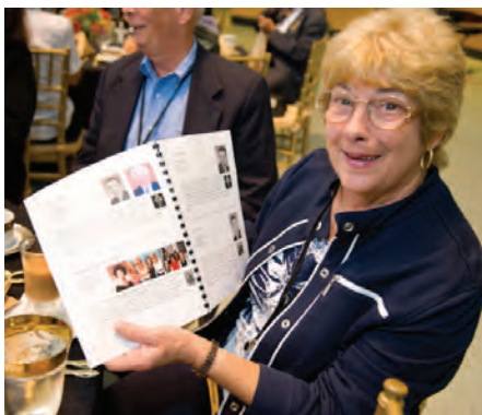
50th Reunion Loyal Guard gets the royal treatment (see p. 7).

Bryant upholds the Reunion @ Homecoming tradition with a full schedule of fun – class reunions at tailgating and in the Alumni Village, the Bulldog Fun Zone for kids of all ages, alumni games, the 50-Year Reunion/Loyal Guard induction, and, of course, the football game, to name just a few. (See the full schedule p. 4-5)