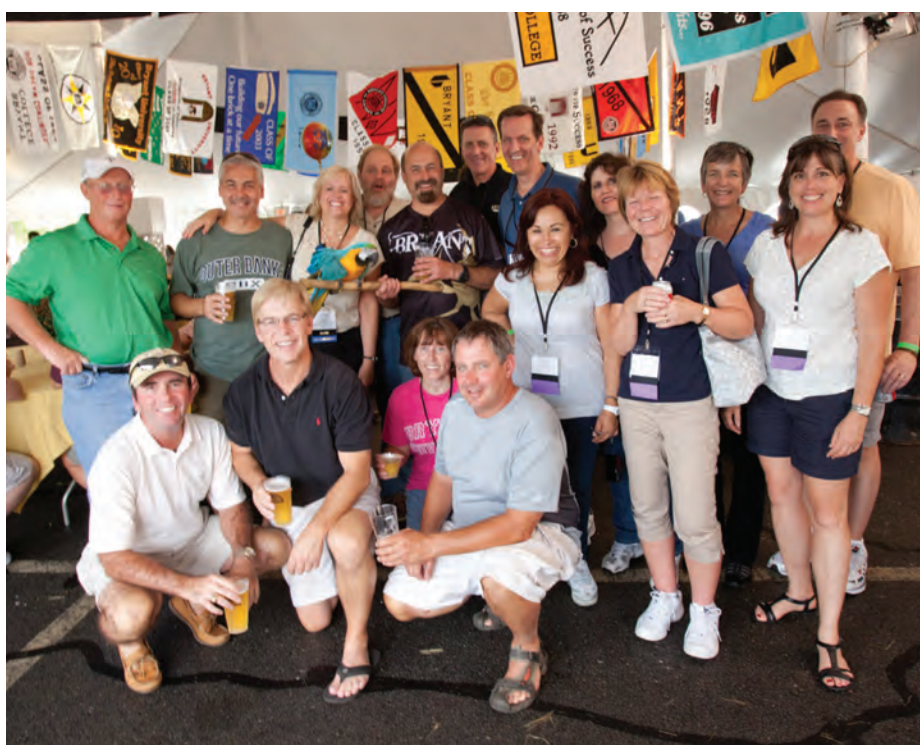
Get ready to reunite with all class years, and all Greek organizations, September 21-23. Special plans are being made for 5th through 50th Reunions.