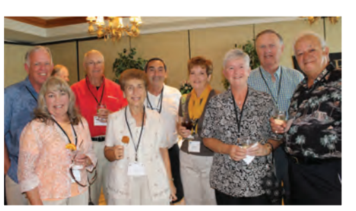
March 18 – The Waterfront Inn, The Villages, FL Our first ever event at The Villages in Florida was a huge success, with more than 40 area alumni attending.

View more pictures at www.bryant.edu/alumniphotos