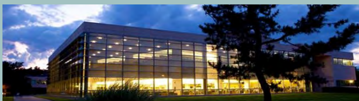
Bryant Library exterior