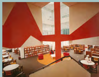
Hodgson Library--Lower Level

As of the 2012-2013 school year, collections included nearly 147,000 print volumes, over 22,000 e-books, 70,000 e-journal titles, and just under 3,000 A/V items. The library also loans laptops (10 general usage, 7 pre-loaded with Rosetta Stone language software, and one with Dragon NaturallySpeaking voice typing software), tablet devices (iPads, Kindle Fires, and Kindle readers), headphones, laptop and phone chargers, calculators, and all manner of basic office and art supplies (poster presentations can lead to some pretty unusual requests where the latter are concerned).