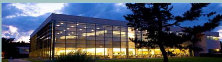
Bryant Library exterior