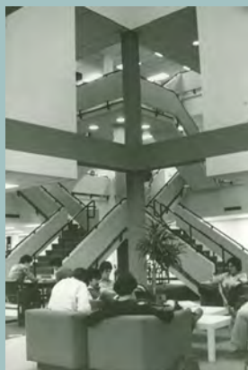
Hodgson Library- 3 Levels

In 1978, the library was rededicated in the name of Edith M. Hodgson, an alumna of the class of 1916. In 1983, the library grew again, gaining an additional 17,472 square feet of space, making room for 850 total seats and a shelving capacity of up to 190,000 volumes.