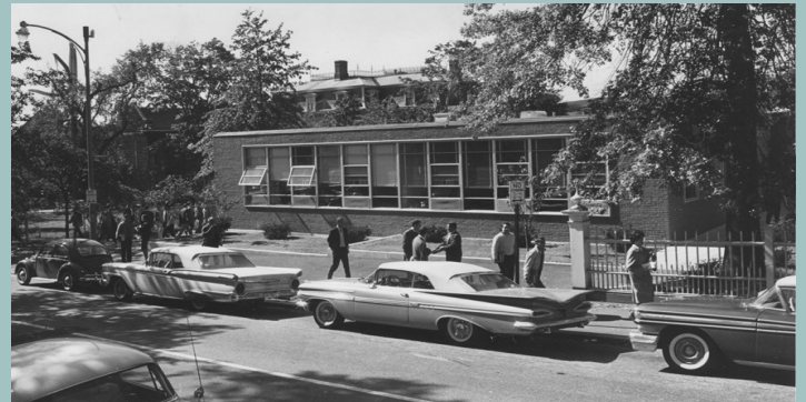
The original Kilcup Hall, 148 Hope Street, Providence, RI.