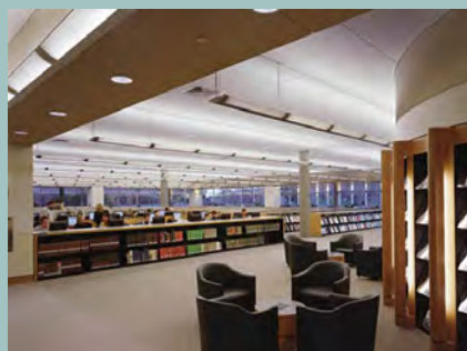
Library First Floor

The staff tries to provide high-touch solutions to users' needs, and buoyed by the university's emphasis on technology, we work hard to serve them in the locations and formats with which they are familiar. We have provided reference service via email, text, and webchat for several years now, and subject librarians make themselves available through individual classes' Blackboard sites. In order to make the typical library introduction more inviting, we created an interactive library tour using Articulate's Storyline software, resulting in a learning object that engages as it informs. Students demanded a better way to ensure they had study space when they needed it, so we researched and launched a room booking system with the help of the University Scheduling department.