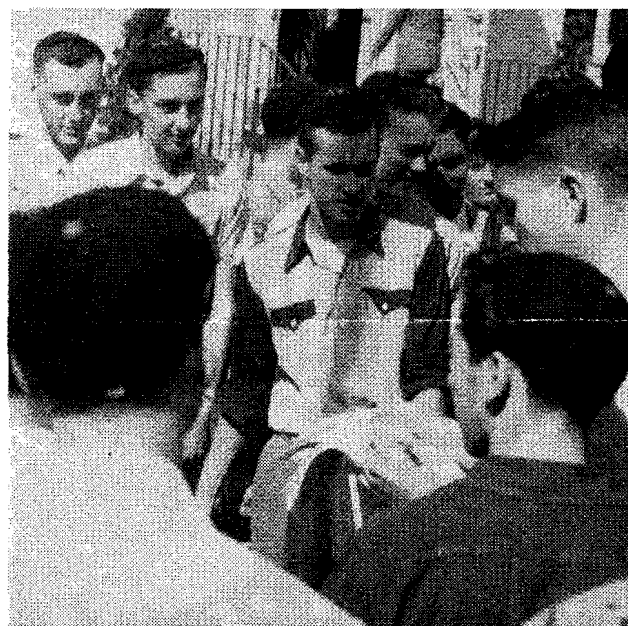
A freshman class gathers in front of Memorial Hall for Vigilantes' roll call. Freshmen not answering roll call or wearing beanies were given demerits.

For the first time since 1938, Freshman activities were resumed on campus. On Monday, September the 12th, the first day classes began, Freshmen walked about the campus with their head gear and buttons passing the watchful eye of the upperclassmen. Members of the Vigilante Committee, wearing orange arm bands, gave punishment to Freshmen, who violated the rules of conduct.