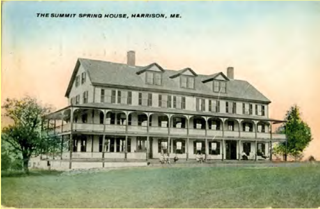
Image courtesy of Fogler Library Special Collections, University of Maine

http://digitalcommons.library.umaine.edu/spec_photos/527/