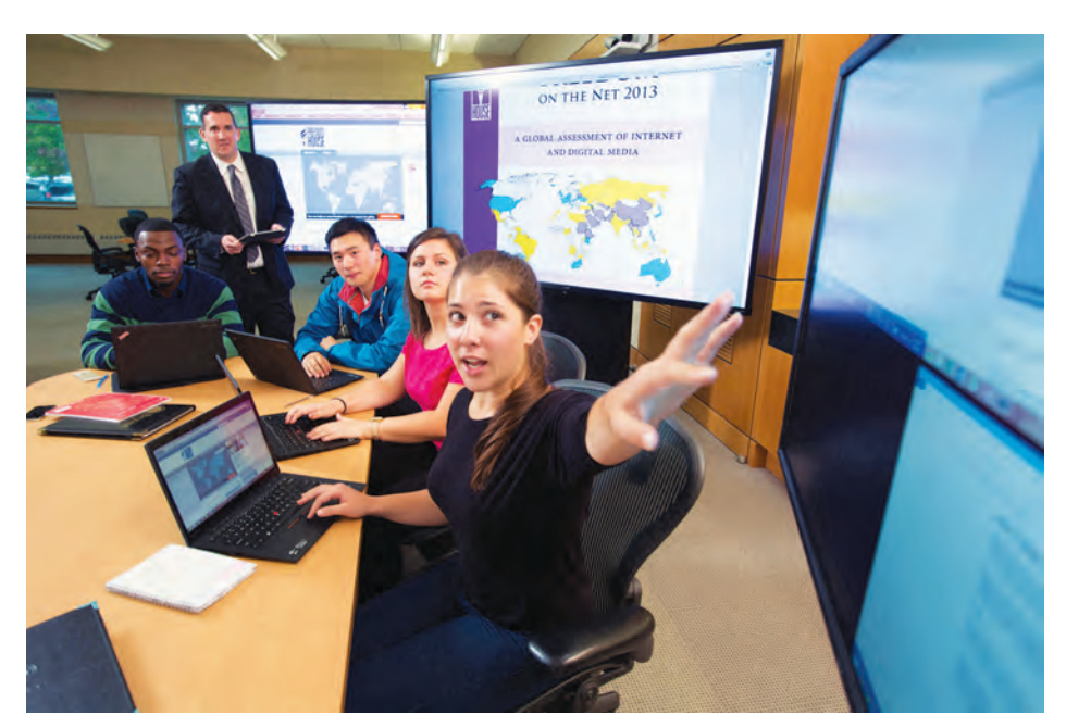
The technology in the redesigned Bello 102 seminar room allows students to "take the wheel" during class time.

>> See latest news by going to bryant.edu/news/university-news/