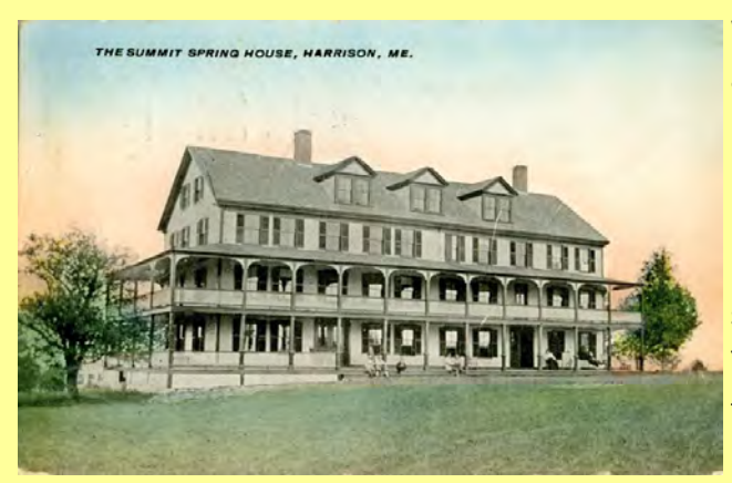
Image courtesy of Fogler Library Special Collections, University of Maine

http://digitalcommons.library.umaine.edu/spec_photos/527/