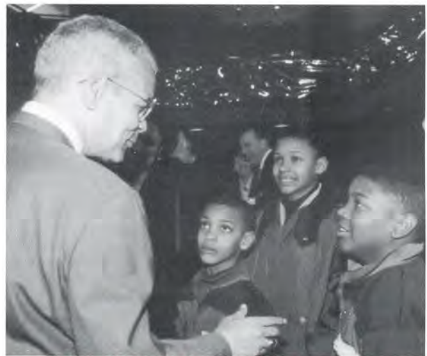
Julian Bond meets with some children who attended the lecture with their parents.