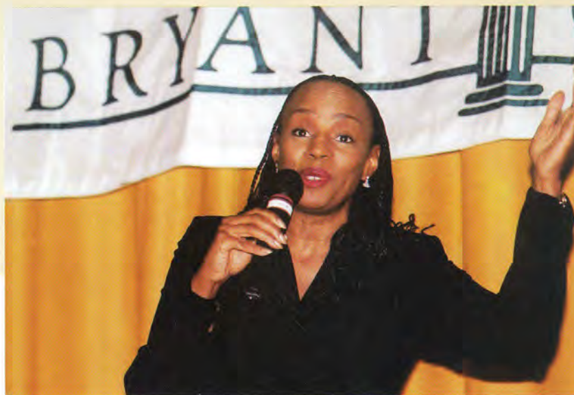
Susan L. Taylor, editor of Essence magazine and one of the most influential black journalists today, tells how a positive attitude in life can help reach solid goals.