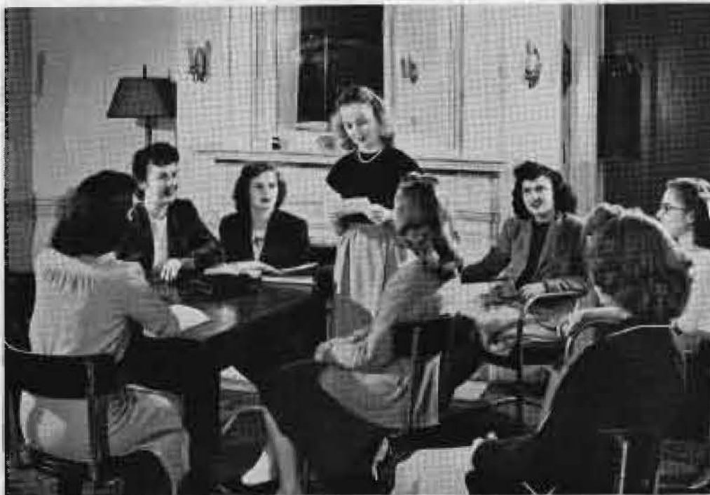
The lounge in the main building is popular between classes

XXXXXXXXXXXXXXXXXXXXXXXXXXXXXXXXXXXXXXXXXXXXXXXXXXXXXXXXXXXXXXXXXXXXXXXXXXXX