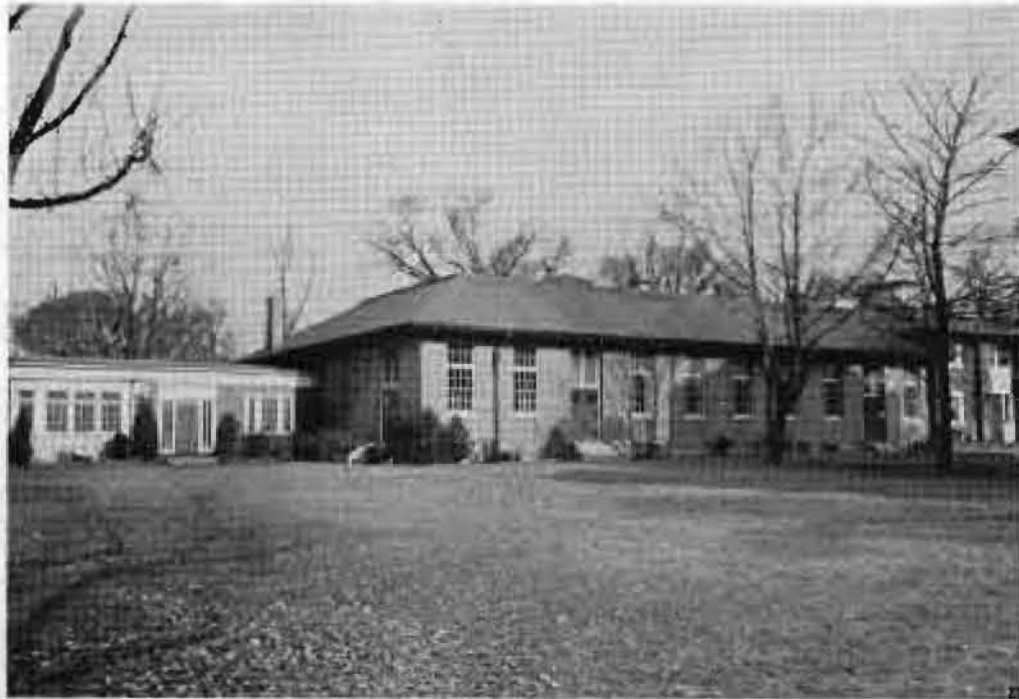
The gymnasium is in constant use