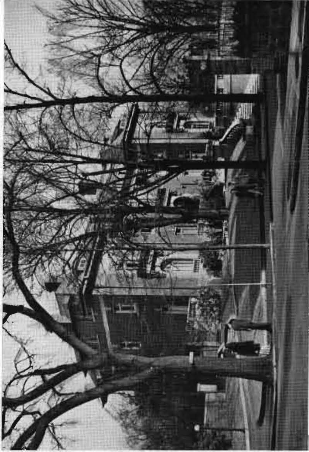
The main college building is shaded by magnificent elms in the residential section of Providence