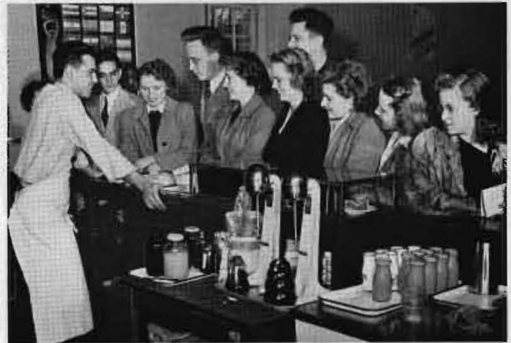
What good times she had at the snack bar in the cafeteria!