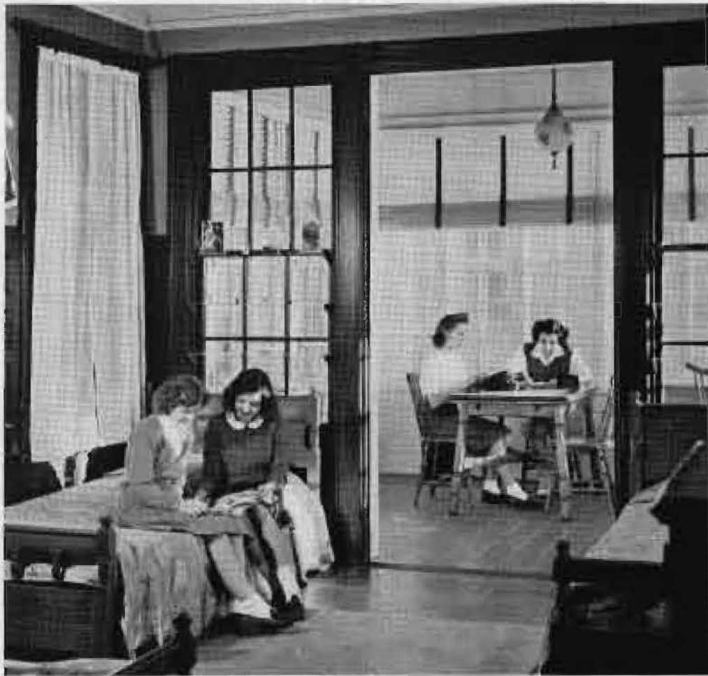
"What a delightful bedroom!"