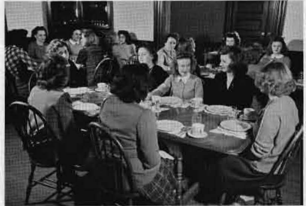
But she also liked to eat and found congenial companions in the dining room!