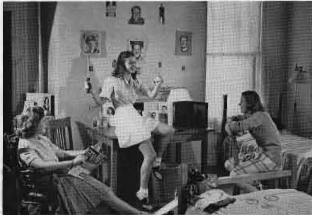
And when classes are over . . .