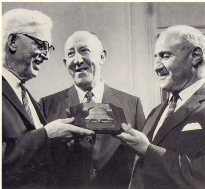
Receiving the first Rhode Island Bar Association Liberty Bell Award for community service.