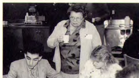
The competition was intense at the Bryant Challenge.