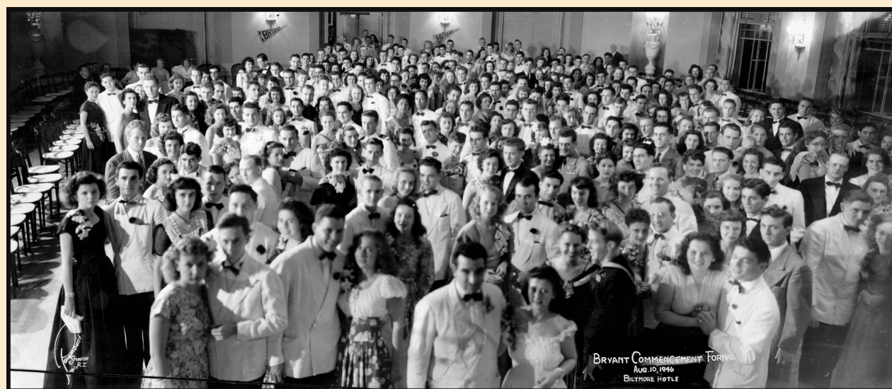
Retouched Photograph of 1946 Commencement formal

https://digitalcommons.bryant.edu/docu/i8/ . Both letters are on display in the Provost's Office. The CMDS department has also started reframing and preserving a photograph of the Commencement formal for the class of 1946. There is some damage to the top layer of the photograph, so we have digitally scanned the photograph and digitally restored the image. Now completed, the photograph will be uploaded to the digital repository and the photograph will be mounted in an archival mat and reframed. As we've been in the process of restoring this photograph, we've begun to discover more about the individual graduates, and how their stories intersect with the history of Bryant University which we would like to highlight in a future newsletter issue.