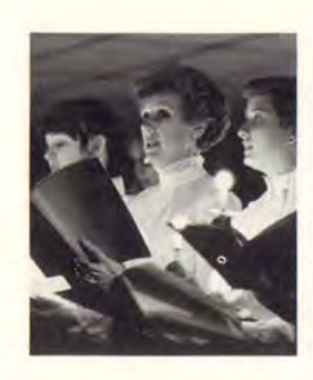
Festival of Lights

Among the major findings of the 1985 study are that the average increase in sales for all clients was 16 percent. This translated into an average increase in profits of 71 percent. Average one-year sales for the 56 new businesses were more than $98,000, the study indicated. And the additional tax revenue generated by these increases in employment, sales, and profit topped $734,000. That means every dollar given by the SBA and DED to support the SBDC produced $2.30 in taxes going back to the governments. The two studies also indicate that businesses