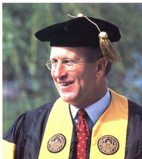
David M. Walker, comptroller general of the United States, is the Graduate School speaker.