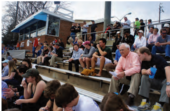
March 10 | Chapel Hill, NC Bryant Men's Lacrosse vs. North Carolina

It was a nail-biting lacrosse game for our Bulldogs in Chapel Hill, NC. Bryant eventually fell 9-10 to the Tar Heels.