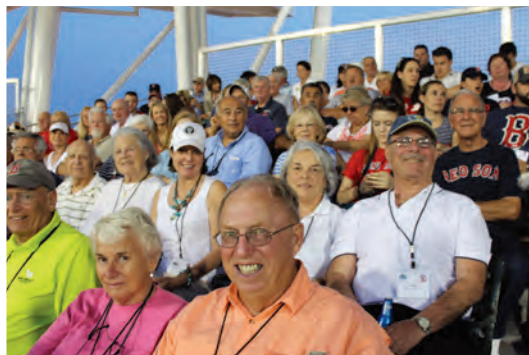
March 13 | Ft. Myers, FL

It was a nail-biting lacrosse game for our Bulldogs in Chapel Hill, NC. Bryant eventually fell 9-10 to the Tar Heels.