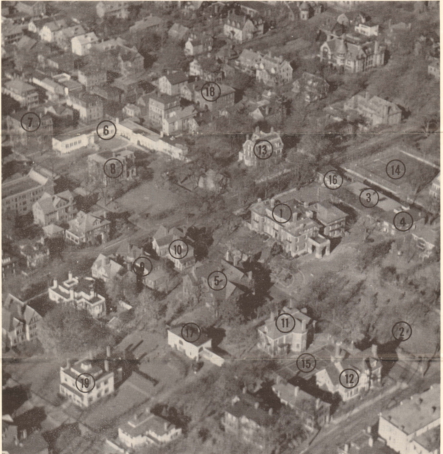
THE BRYANT CAMPUS. This airplane view shows the majority of the buildings where the 1958 Homecoming will be held. 1. South Hall. 2. The Refectory. 3. Bryant Auditorium and Gymnasium. 4. Student Union. 5. Gardner Hall. 6. Memorial Hall. 7. Harriet Hall. 8. Eldridge Hall. 9. Bryant Hall. 10. J. Carroll Hall. 11. Salisbury Hall. 12. Stowell Hall. 13. Administration Building. 14 and 15. Tennis Courts. 16. Placement Bureau. 17. The Barn Studio. 18. Alumni Hall. 19. Allan Hall. Athletic Field House and six Residences for young men not shown.