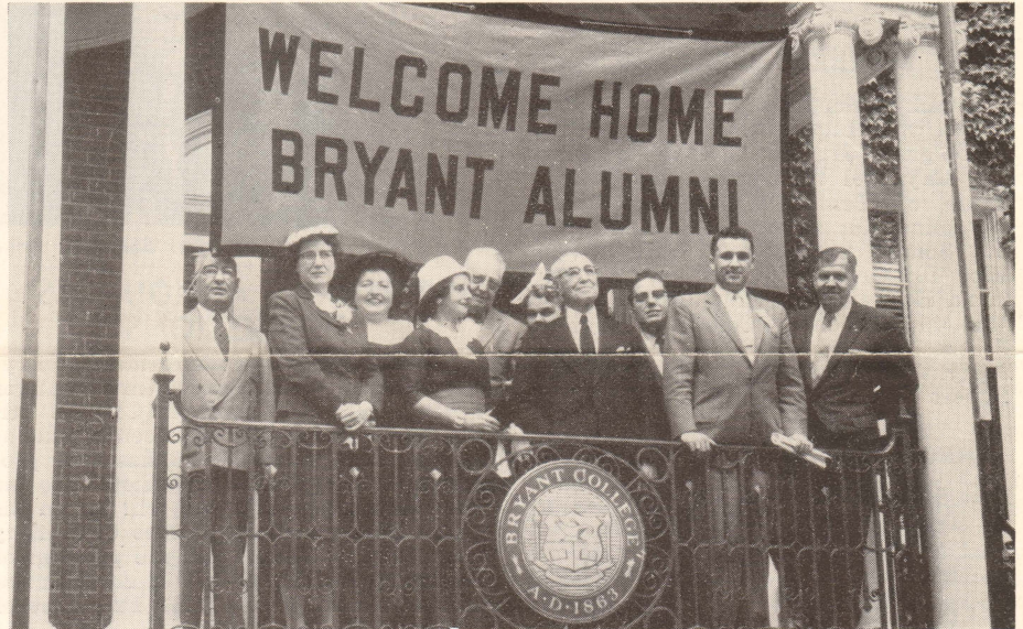
Join Your Classmates for a Happy Homecoming, June 6 and 7!

Early reservations will assure seats with your classmates.