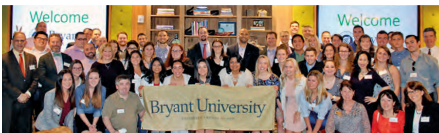
Enthusiastic Bryant alumni and students gather at TripAdvisor's Needham, MA headquarters.

Your participation will allow us to position Bryant even more competitively for the future. To learn more, look for Bryant magazine's annual philanthropy issue in your mailbox this summer or visit www.bryant.edu/giving .