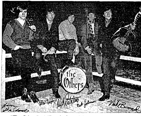
"The Others" of "Lonely Street" fame are the feature attraction touight from 8:00 to 1:00 at the Sheraton-Biltmore for the next-to-last night of May Queen Weekend.