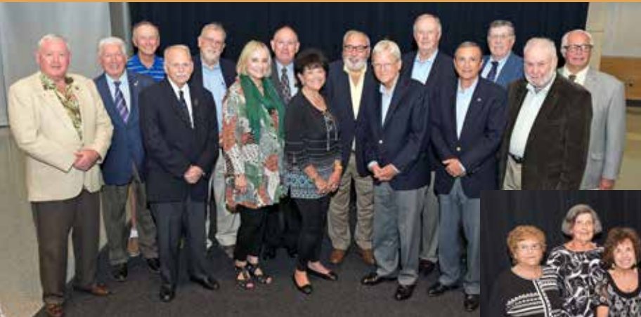
The Class of 1967 joins the Archway Society (formerly the Loyal Guard) – those who graduated 50 or more years ago.