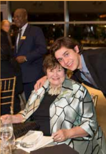
The Champions for Philanthropy awards dinner, which takes place every Reunion @ Homecoming weekend, recognizes our most generous donors. See story on p. 9 for more information.