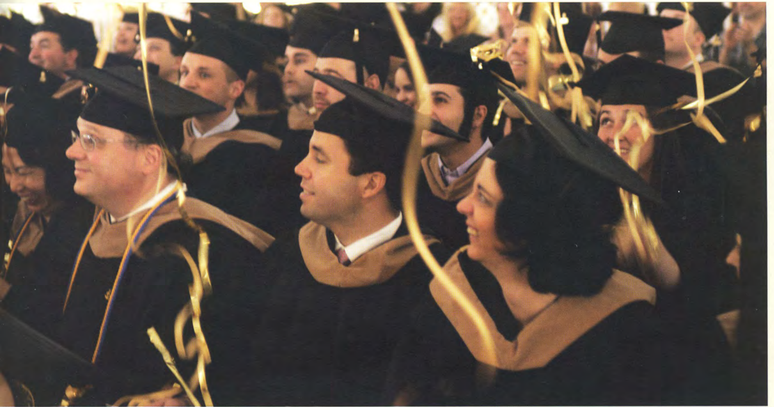
The Commencement ceremony for graduate students was held on Thursday, May 18, for 154 students.