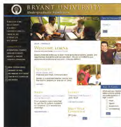
The new admission web site

For more information about the Bryant web site, contact the Webmaster at www@bryant.edu . For more information about the new admission site, contact the Office of Admission at admission@bryant.edu .