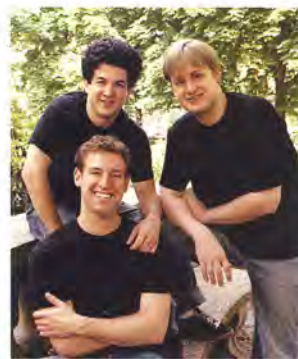
Time for Three

The President's Cultural Series kicks off the 2006-07 season on September 26 with a reprise of Anima and Time for Three. Anima, a classical quartet featuring violin, viola, cello, and flute, will perform at 6:30 p.m., followed by Time for Three, an acclaimed string ensemble that plays "Bach to Bluegrass... and everything in between."