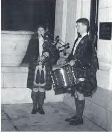
Scottish pipers greeted more than 275 guests arriving for Bryant's 125th Anniversary Ball at Rosecliff Mansion in Newport on November 14.