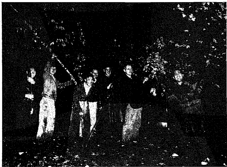
Decorating for the Harvest Fantasy turned out to be a sort of damp "Woodchoppers Ball" for the group of BIB men pictured above.