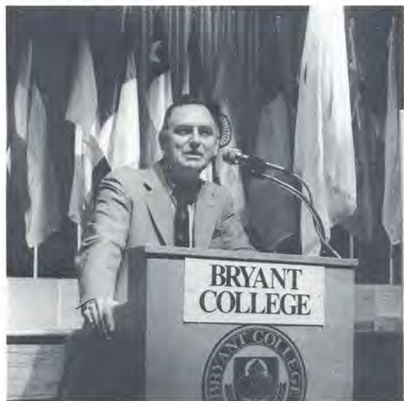
President O'Hara delivers State of the College Address before a backdrop of international flags.

That agenda includes another new dormitory for an additional 200 residential students, ground for which will be broken next spring, and a field house, which is being planned at a cost of approximately $10 million.