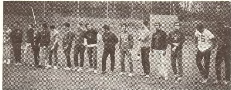
Shown here is the student lineup. This was one of their more complicated plays of the game. Shortly after this picture was taken, the team trainer appeared with his whip and chair and managed to drive the team back to their benches.