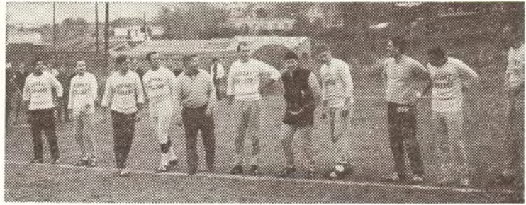
This was the lineup for the faculty. They are seen here in no apparent order, which is exactly the strategy used throughout the entire game. Prior to this, each member of the faculty reportedly went through a rugged workout. Each member did two laps of the refreshment stand, and one sit-up.