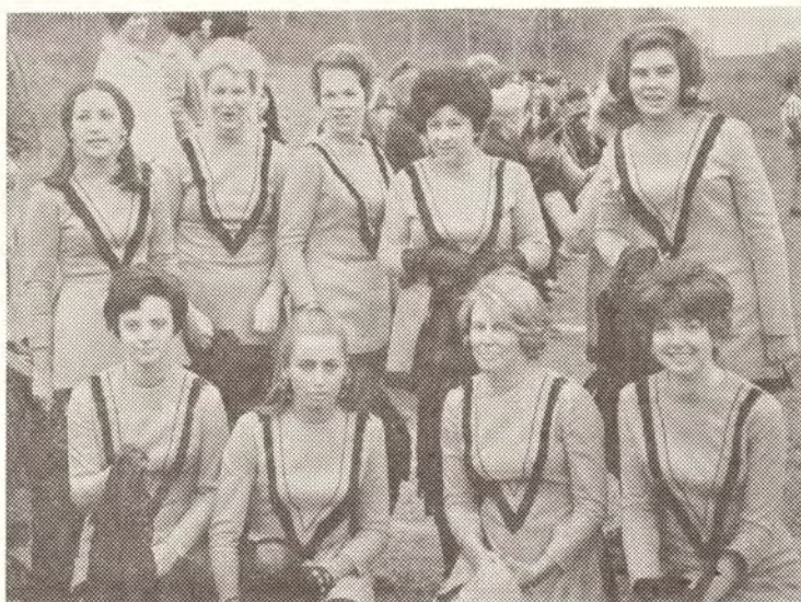
The much needed cheering for the faculty was provided by the above pictured cheerleaders. The girls are seen here doing one of their more exciting cheers.