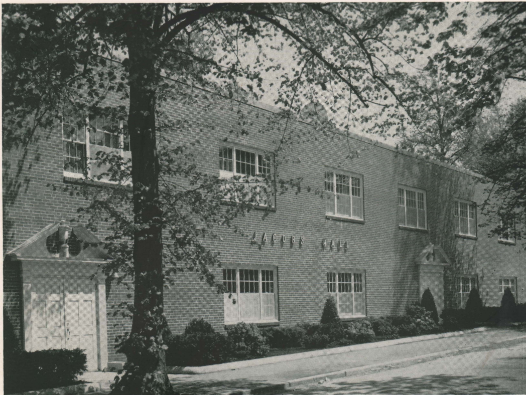
A portion of the building showing the entrance to the Dining Hall and Henry L. Jacobs Library.