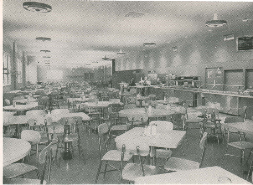
The Student Dining Hall

On the second floor is the Dining Hall, large enough to accommodate 450 students at one sitting. It has the friendly and lively spirit befitting a college social center and the colors are of delicate pinks and greens, sparkled with maroon. The floor is of the terrazo type. Hanging fixtures throw diffused light to round out the overall beauty of the interior. The Faculty Dining Room seats 60 people. It is tastefully decorated in warm, yet restful tones of grey, yellow and blue and features a modern mural on one wall. Colonial brass fixtures give it a festive atmosphere. The furniture throughout the building is new and modified modern in style. The colors and the decoration were done under the direction of a professional decorator-architect, Mrs. Gretchen Nelson.