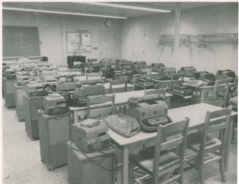
One of the Typewriting Classrooms