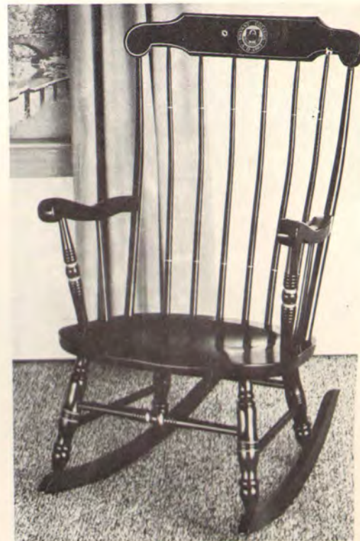
Boston Rocker – $55 Delivered at the College

Place your order anytime during the year by sending a check to the Bryant College, Box 14, Smithfield, RI 02917.