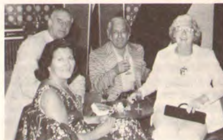
Alumni foursome having cocktails in Mexico.

Where else in one week could you visit a land of sharp contrasts; miles of Pacific coastline alternating with towering mountains. Culture is also a mixture of simplicity and sophistication, a blend of formal and festive.