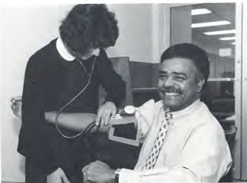
President performs well under pressure

Also, take time to read the payroll stuffers and health flyers to come.