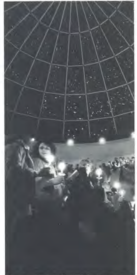
The Rotunda reflects candlelight at the annual Festival of Lights.

In particular disfavor with the Puritans