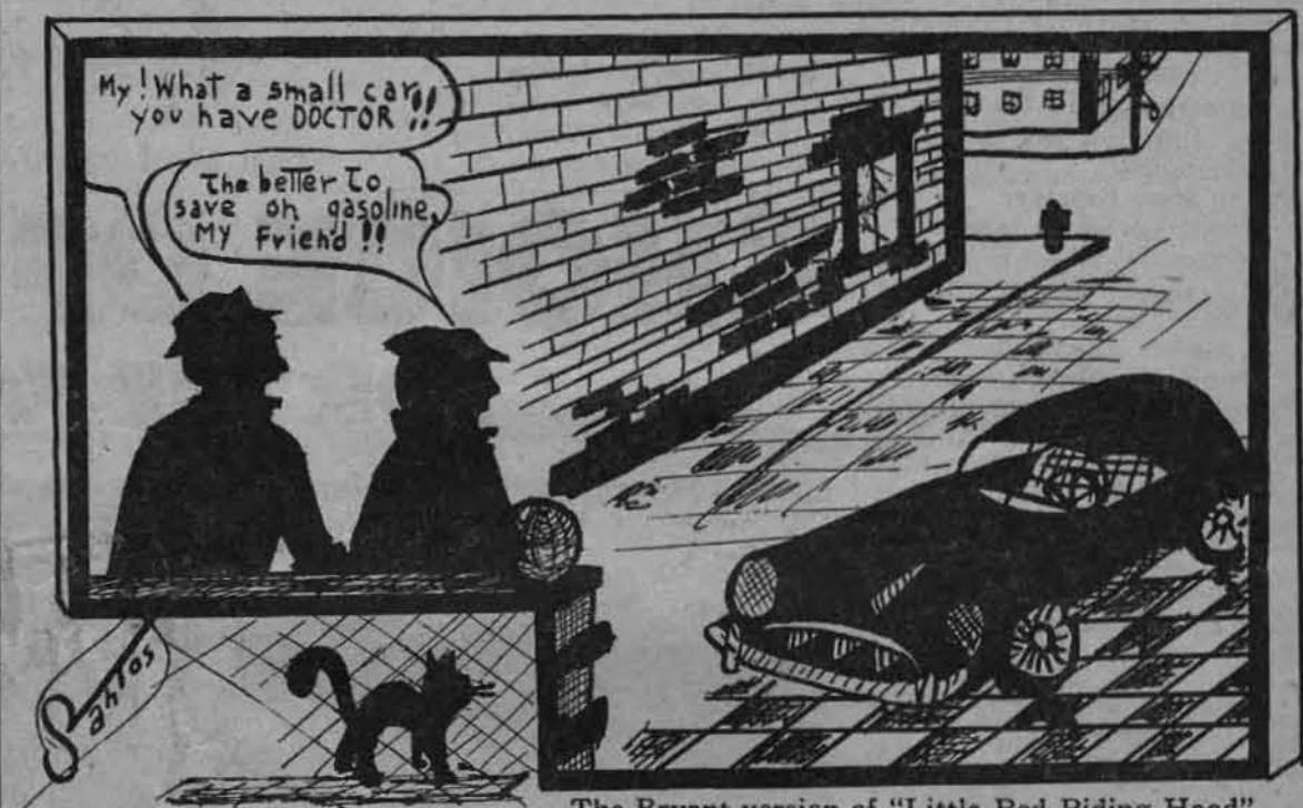
The Bryant version of "Little Red Riding Hood"

The Cafeteria will accommodate all Fraternities and Sororities for social functions, at special rates.