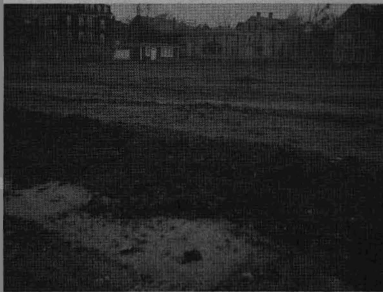
New earth laid as modernization of Bryant Athletic Field begins

In addition to using the field for softball, touch football will be organized in the fall of 1955. Plans for the installation of other sports such as volleyball, badminton, and the pitching of horseshoes are now being completed. This will give more members of the student body the opportunity to participate in more sports.