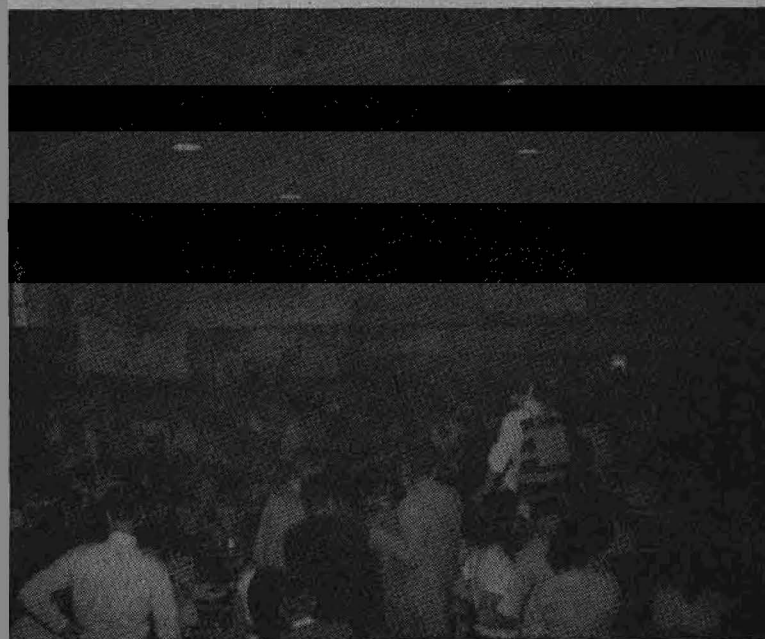
Scene portrays confusion and disorder during Hell Week days in College Auditorium.