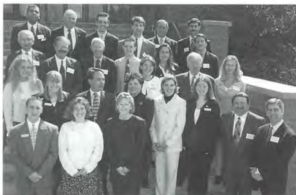
Participants gather in front of the Bryant Center before departing campus.

Take one accounting major, match with a CEO of a scientific product development company, and mix in one lively humanities class. The result: an exciting open exchange of ideas, a host of questions, and an opportunity to view life's lessons from different perspectives. So was the case with the 16 participants in the third annual Alumni Day, sponsored by the Alumni Relations Office and hosted by the Student Alumni Association on Friday, September 26th.