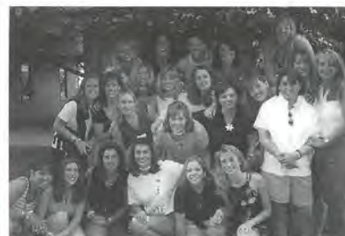
Phi Sigma Sigma Sorority Reunion held July 19, 1997 in Newport, RI