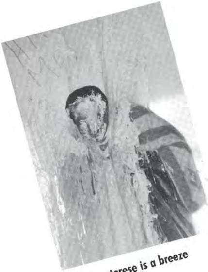
Computerese is a breeze