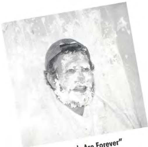
"Diamonds Are Forever"