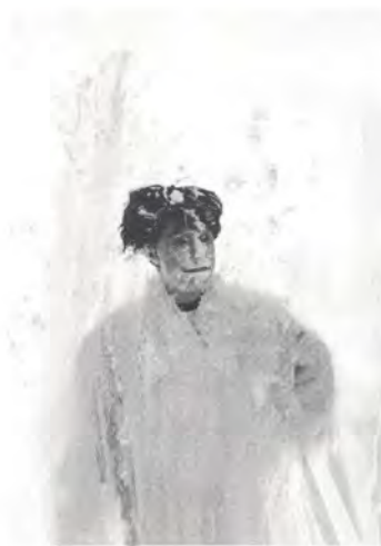
Appreciates a good sport