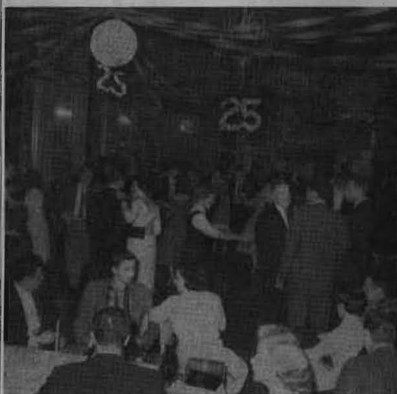
Celebrants gather to commemorate the Silver Anniversary of Phi Sigma Nu Fraternity of Bryant College.