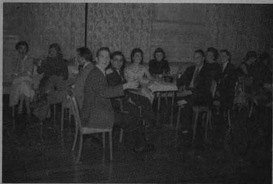
"Sittin' around, taking life ezee" at the Phi Sig 25th Anniversary Dance.

The reception, the last Bryant function to be attended by the Seniors as students, undoubtedly caused many of the Seniors to look back upon their years at Bryant as rich and rewarding — rich in thoughts of friendship and rewarding in the knowledge gained from the classroom and through extra-curricular activities.