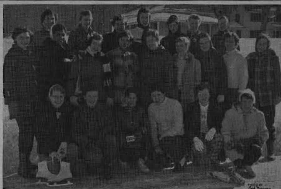
Alpha Phi Kappa Girls Cavort In New Hampshire Snow