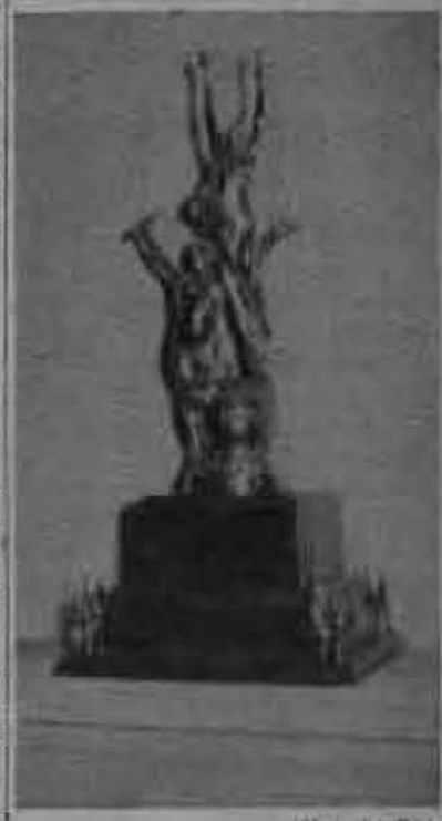
The Bryant College Trophy for Community Service