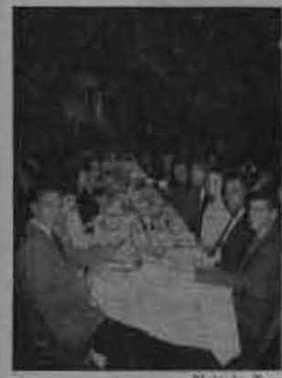
One of the more than twenty tables at the Thanksgiving Party.