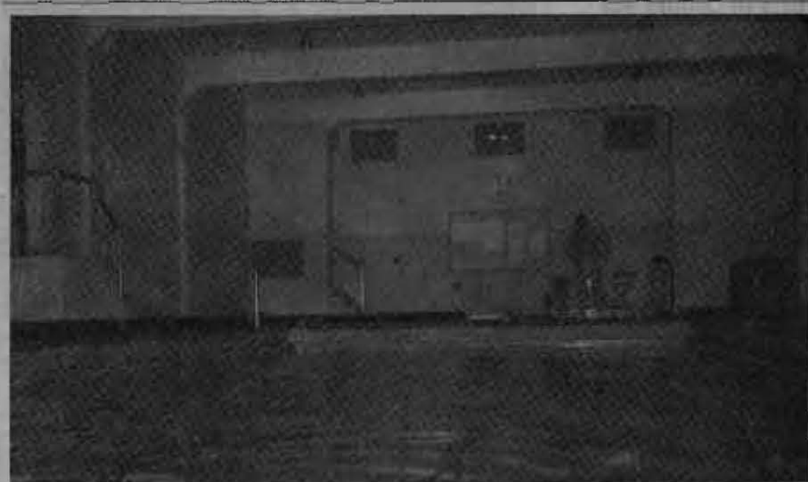
View of pool at the Plantations Club, Abbott Park Place, Weybosset Street. Bryant students will have the opportunity to use this pool free of charge during the winter season. Schedule of hours is given below.

Kappa Tau walloped Phi Sig, 45 to 26. The winners had the game sewed up from the opening basket.