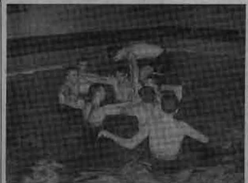
Everyone had a good time and a good swim last Friday when the brothers of Chi Gam enjoyed a private splash party at the Plantations Club.