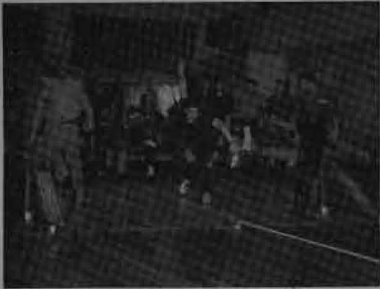
DiFillippo, bowling for Phi Sig, shows how to knock 'em down.