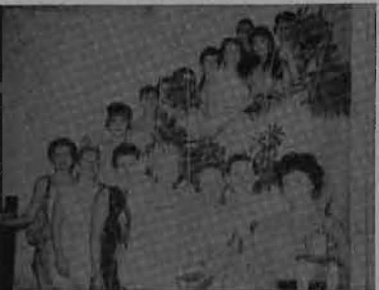
Gardner Hall girls pose in the costumes of ancient Rome with the Dorm Council Trophy.

HILL'S COLLEGE SUPPLY STORE Next to Avon Cinema TYPEWRITERS SALE, RENTAL, REPAIRS