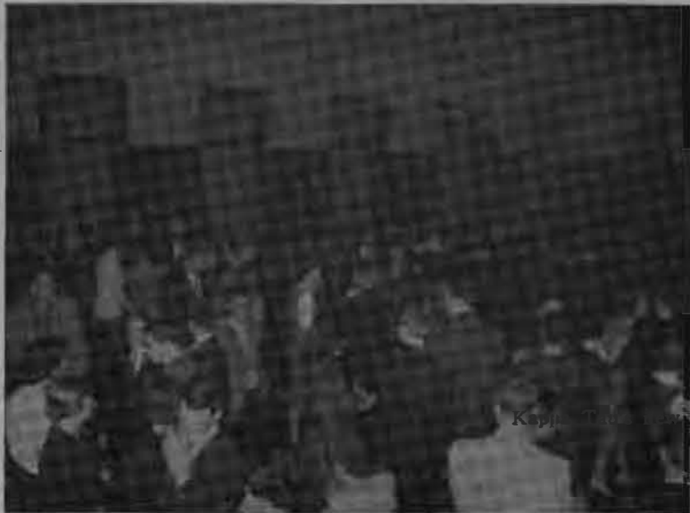
Newly arrived freshmen are gathered in the school auditorium at the Freshman Orientation Dance. The music was supplied by Bryant's own Stardusters.