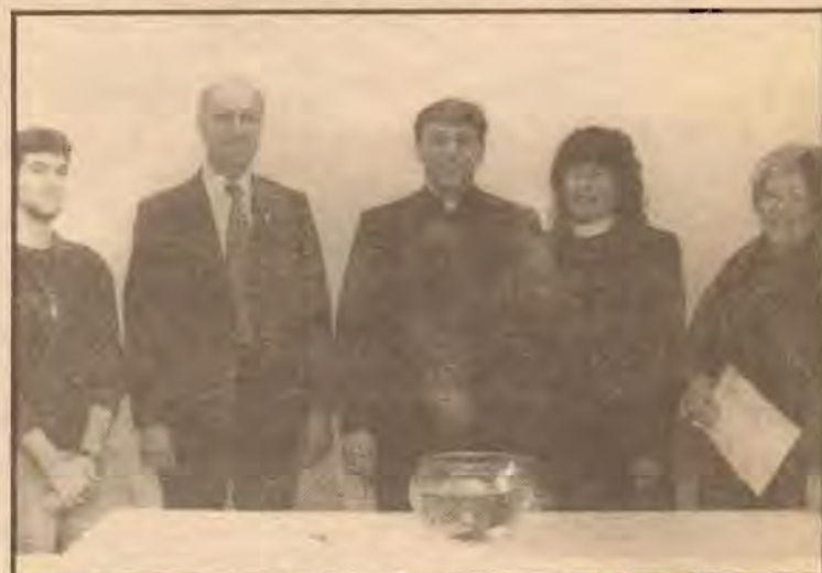
Members of the Bryant Clergy and Hillel following last night's prayer service.

written in journal form, will be coming out in print next month. It is published by the Campus Ministry Journal in Chicago.